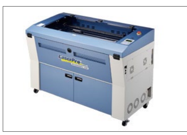
100w Laser Cutter 960mm x 450mm