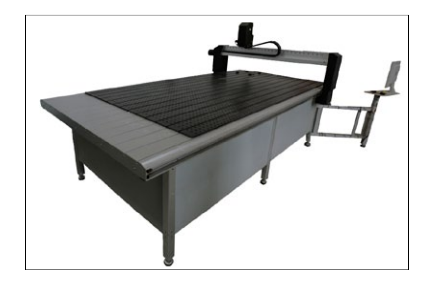
3 Axis Milling MAchine 1.5m x 3m